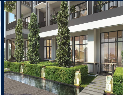
3 - Bedroom

TYPE C1 94 SQM / 1012 SQFT BOOK 1682/01 TO 994-01